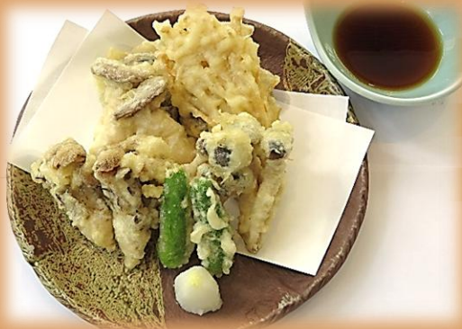
TEMPURA Mushrooms $160