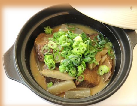
Miso Stewed Beef Tongue $200