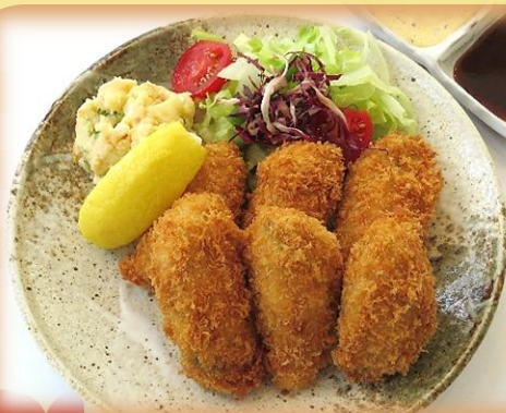
Fried Oyster $180