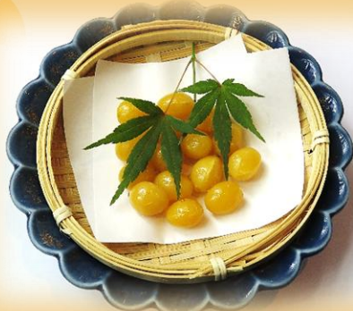
Fried Ginkgo $120