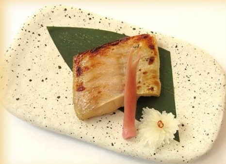
西京 Miso Grilled Tilefish $180